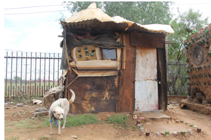
Typical township living conditions, 2017

My doctoral research focuses on how artistic practices can contribute to social-ecological resilience in vulnerable communities. Specifically, I will conceptualise, execute and evaluate transdisciplinary poetic interventions in Cape Town and Mangaung, South Africa,